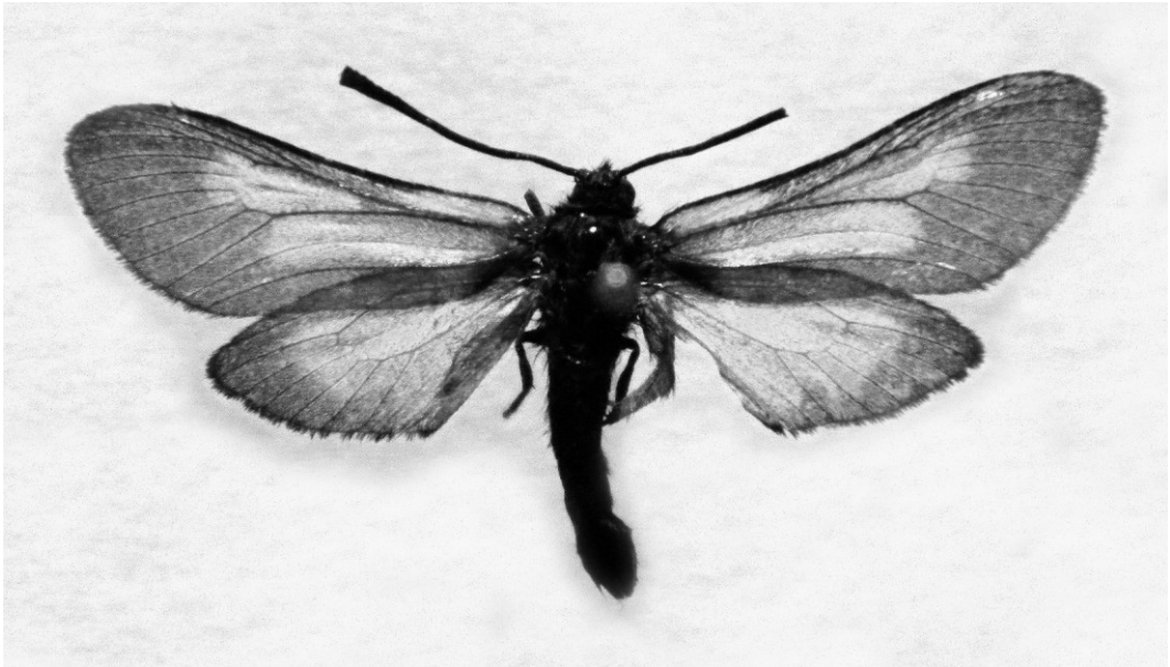
Figure 1. Zygena brizae (Esper, 1800) ♂ from Pod-Dažnik.

One male specimen of Zygena brizae (Fig. 1) was found on a meadow near the village Pod-Dažnik in the foothill of Đurkovo brdo located in central Montenegro, 10 km NE of Nikšić (N 42°49'42", E 19°03'57", 1340 m a.s.l.) (Fig. 2) on 27 June 2013 (leg. Nahirić A.). The meadow is situated near a beech forest; it is regularly mowed and with no signs of succession. The collected specimen can be referred to the subspecies Zygena brizae dvarica Rauch, 1977. This subspecies is characterized by a very broad hindwing border which is broadest at the apex. Streaks on the forewing are dark red and narrow. This specimen is stored in the special collection of Zygaenidae in the Tiroler Landesmuseen, Ferdinandeum, Innsbruck, Austria.