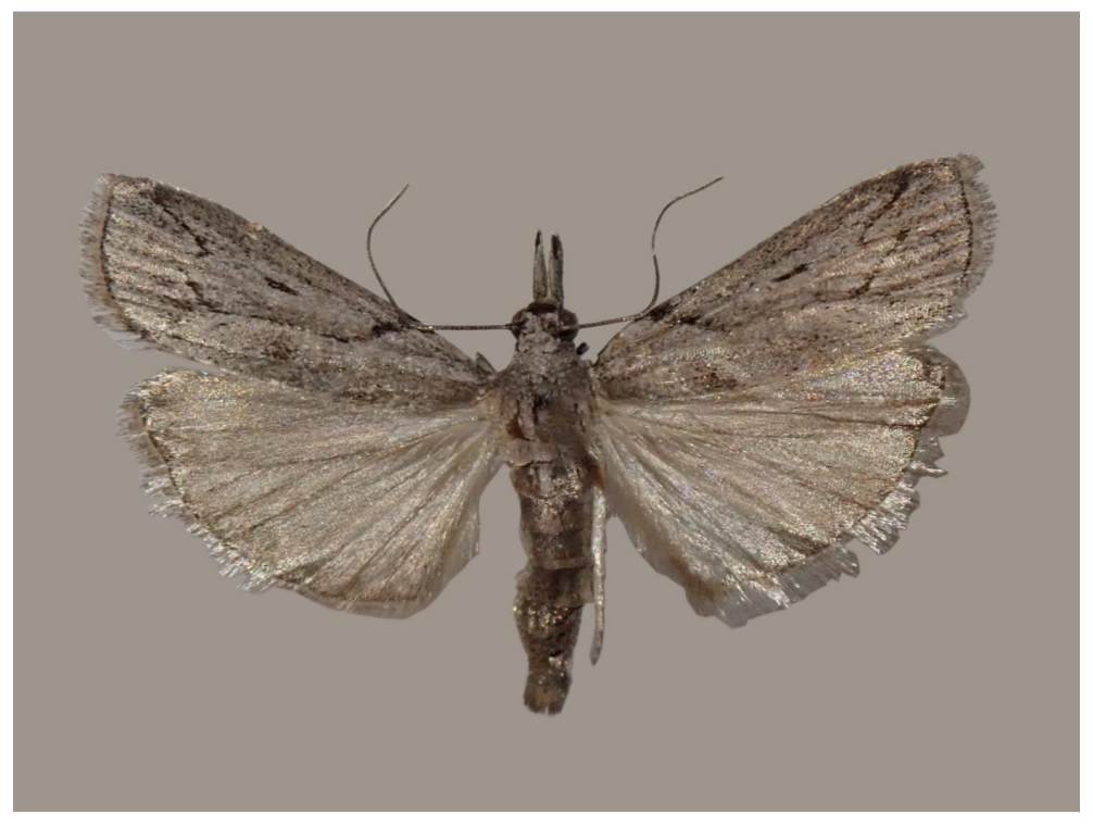
Figure 2. Male specimen of Dioryctria robiniella from the island Lokrum nerar Dubrovnik. (photo by Toni Koren).