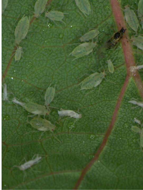
Figure 3. Myzus mumecola , colony on apricot leaf (one alatae viviparous parthenogenetic female and larvae of the same).

Order Hemiptera, family Aphididae, subfamily Aphidinae, genera Myzus , subgenera Myzus . Synonyms: Macrosiphum mumecola Matsumura 1917 and Myzus umecola Shinji, 1924. M. mumecola is morphologically similar to common Prunus persicae feeding species, M. persicae from which apterous viviparous females and alatae can be distinguished by shape of siphunculi. In M. mumecola siphunculi are tapering from base to flange but they are slightly swollen in M. persicae . Also, siphunculi are more than 2.3 times longer than cauda in M. mumecola , and less than 2.3 times longer than cauda in M. persicae (Blackman and Eastop 2021).