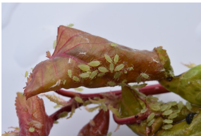
Figure 5. Myzus mumecola , aphids on leaves deformities.