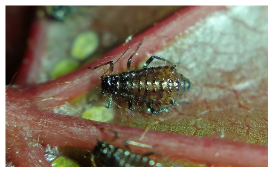
Figure 2. Periphyllus californiensis (Shinji, 1917): apterous viviparous female, on Acer palmatum in May 2021, New Belgrade.

Apterous viviparous females (Fig.2) (2 specimens) are elongate oval, brown. Body length: 1.9-2.7 mm. The head and pronotum are black, sclerotized. Antennae are dark except for the base of antennal segment III and are slightly more than \frac{1}{2} the length of body. The terminal process is 2.1-3.4 times as long as the base of antennal segment VI. The longer hair on the base of antennal segment VI is 50-63 \mu m long and 0.4-0.63-times as long as the base of that segment. Secondary rhinaria are absent, except in alatiform specimens. Abdominal tergites I-VII with paired dark spinal and marginal sclerites, between which there are small pleural scleroites and abdominal tergite VIII with a dark cross band. The spinal sclerites on tergites I-VII are sometimes fused into cross-bands. The siphunculi are dark, stump-shaped with polygonal reticulation and a well-developed flange. The cauda is short, broadly rounded with 10-12 hairs. The femora are mostly dark except at bases. The fore and middle tibiae are dark at bases and apices, with brown middle sections. The hind tibiae are uniformly dark. First tarsal segments with 5 ventral hairs (2 pairs of lateral hairs and 1 median sense peg).