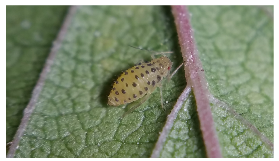
Figure 7. Tinocallis saltans (Nevsky, 1929): oviparous female, on Ulmus pumila L. in November 2021, New Belgrade.