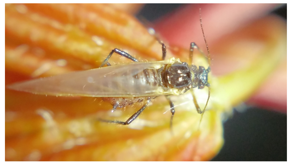
Figure 3. Periphyllus californiensis (Shinji, 1917): alate viviparous female, on Acer palmatum in May 2021, New Belgrade.

terminal process is 1.8-2 times as long as the base of antennal segment VI. The hind tibiae are swollen with about 162-195 pseudorhinaria. Abdominal tergites I-VII with paired dark spinal and marginal sclerites. Abdominal segments VII and VIII are elongated.