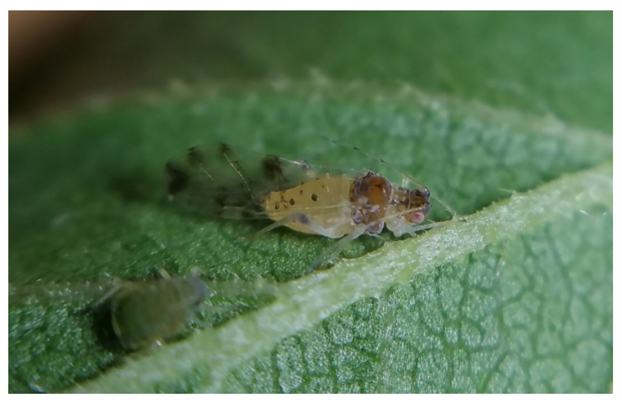
Figure 6. Tinocallis saltans (Nevsky, 1929): alate viviparous female, on Ulmus pumila L. in May 2021, New Belgrade, lower left: Aphis sp.

marginal hairs. Mesonotum, metanotum and abdominal tergites with pairs of spinal and marginal hairs on wart-like, pigmented tubercles. The cauda is knobbed. The siphunculi are short, truncate and dark. The legs are pale with some pseudorhinaria.