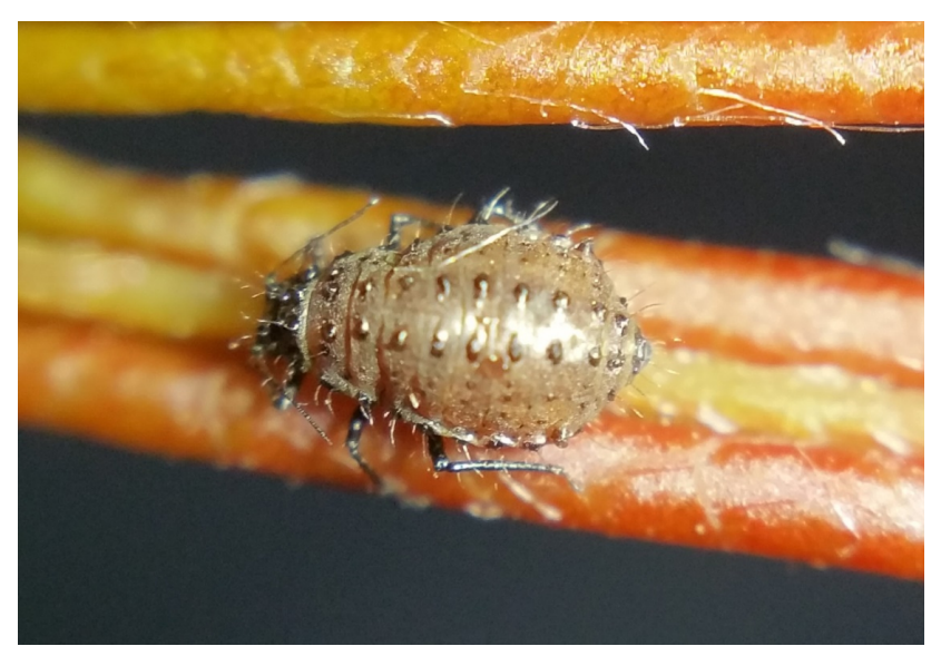
Figure 1. Periphyllus californiensis (Shinji, 1917): fundatrix, on Acer palmatum in April 2021, New Belgrade.

Morphology: Fundatrices (Fig.1) (2 specimens) are oval, brown. Body length: 2.5-2.6 mm. The head and pronotum are black, sclerotized. The antennae are 5-segmented, approximately 1/3 the length of the body (0.29-0.35 x body length) and are dark except for antennal segment III. The terminal process is subequal to the base of antennal segment VI. Mesonotum, metanotum and abdominal tergites I-VII have paired dark spinal and marginal sclerites and pleural scleroites between them. The legs are dark. The siphunculi are dark, truncate with a flange, shorter than in apterous viviparous female. The cauda is broadly rounded.